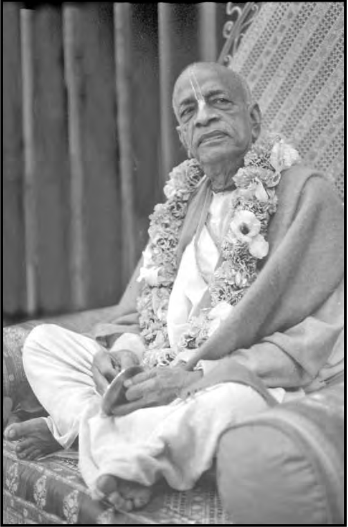
nitya-līlā-praviṣṭa om viṣṇu-pāda ŚRĪ ŚRĪMAD BHAKTIVEDĀNTA SVĀMĪ MAHĀRĀJA