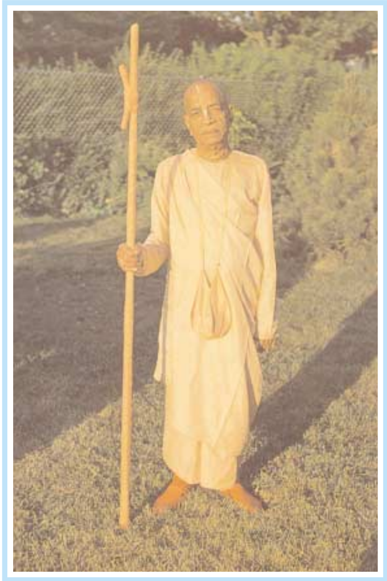
Śrī Śrīmad A.C. Bhaktivedānta Swami Prabhupāda